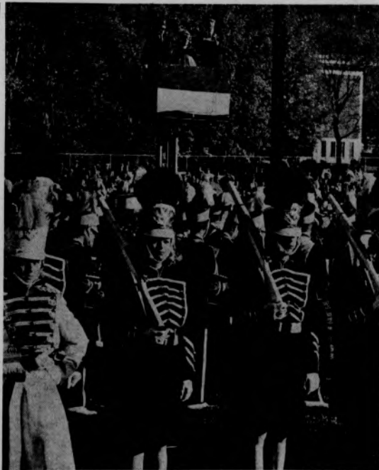
A local school band passes in review at the 14th Annual Pretzel Bowl Game which was held last Saturday. A capacity crowd of 7,500 enjoyed the warm sun as they watched the Albright Lions trounce the Greyhounds from Moravian by a 40 to 0 score.

There will be an important meeting of all members of THE ALBRIGHTIAN News Staff today. Report to the office in Krause Hall at 3:00 p.m. Please be prompt!