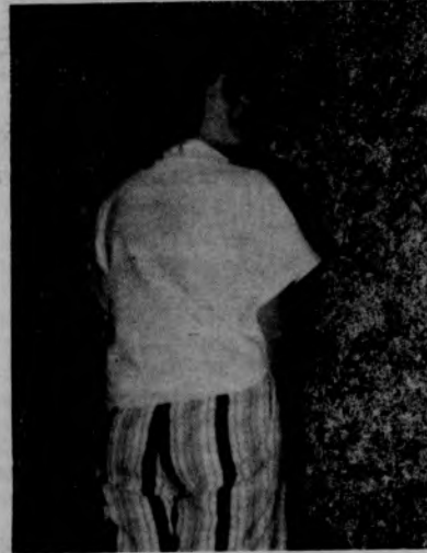
Freshman Albite student in the midst of an identity crisis in the 5th floor bathroom at Moan Hall (identity remains anonymous to protect the poor girl).

Then Albite's Apathetics Anonymous is for you! details coming soon ... if someone feels like making them