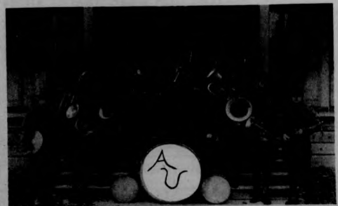
The Albite University Marching Band is getting geared up for next year! Interested in joining? First meeting next Thursday in the C.C. North Lounge -- BYOH (bring your own horn).

One administrator summed up the meeting, while spitting a few cookie crumbs, remarked: "Thizz izz a very important meeting for uzz. We are trying to accomplizz some positive changezz for our studentzz."