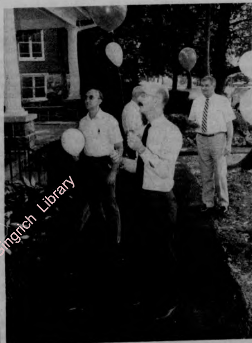
"Auntie Em, Auntie Em...I want to come home!"