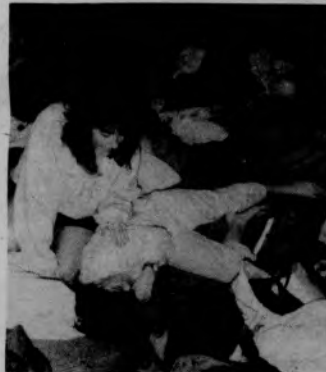
Albite Auditorium converted into shelter for recovering victims of previous food service.