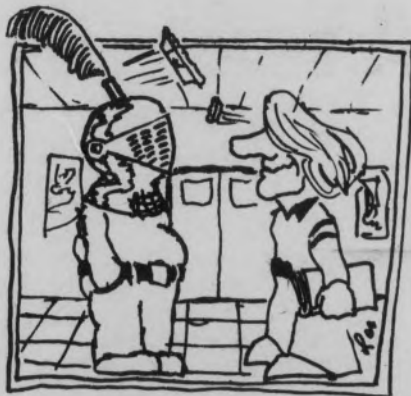
Pie throwing contest ... BOX 107

Albright received honorable mention in the event out of approximately 130 schools participating.