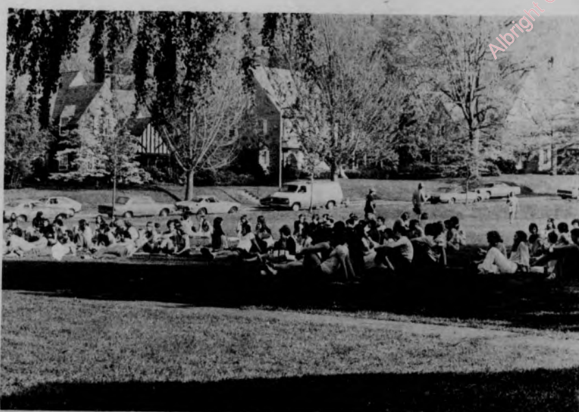
WHAT'S EVERYBODY WAITING FOR ??