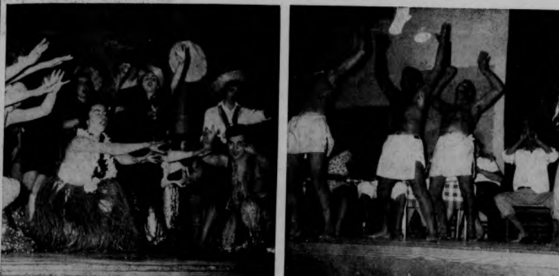
Back to nature proved to be the popular trend in last Friday night's Stunt Night skits, for both groups who turned in prize-winning performances capitalized on swaying palm trees and native terpsichoreans. Shown above are the Mu's in their final "aloha" (left) and the APO jungle band (right).