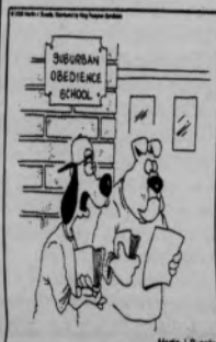
"What's the point in giving us homework? They know we'll only eat it."