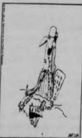
"And on that day you will feel my wrath with the heat of a thousand suns! You will recede into the depths of hell and you will bear witness to my fury! ... Oh, I'm sorry, I thought this was line 2."