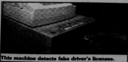
This machine detects fake driver's licenses.

Under the crime code, the fine cannot be less than $1,000