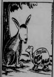
"I was gonna ask for a friendly re-match, but never mind."

Cartoons and puzzles the courtesy of the USBIC Educational Foundation