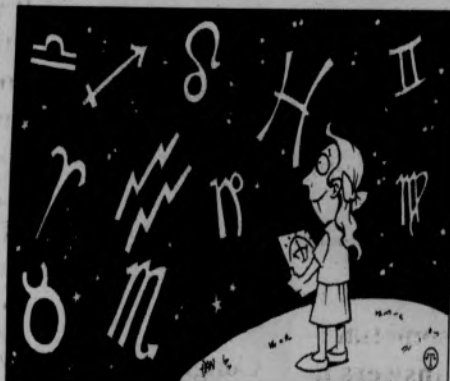
Is your future in the stars? What we believe, we can achieve, astrologers say.

In 2001, this phenomenon will trigger the ingenious influences of