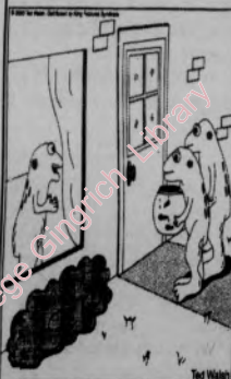
"Honey, the Hendersons are here ... and they brought the kids!"