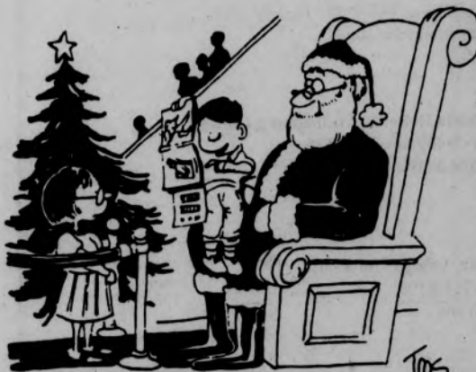
"I want her."