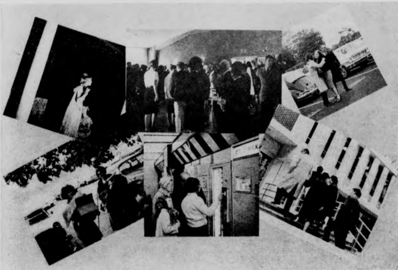
PARENTS ON CAMPUS —These scenes depict campus activities of Saturday, October tenth with one unique addition . . . parents.