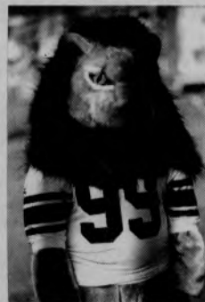
Lions mascot in attendance.

In the end some of the students looked back at their experience of Homecoming 2000 and one