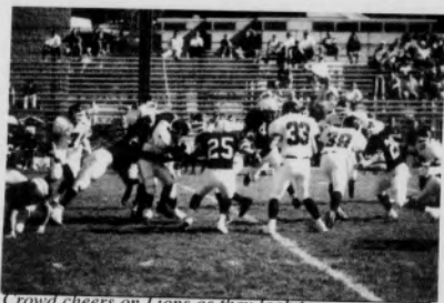
Crowd cheers on Lions as they look to win.