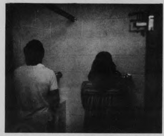
Two North Hall resident assistants discuss the problems that exist in a coed dormitory and search for some solutions.