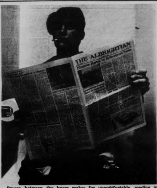
Breeze between the knees makes for uncomfortable reading in men's bathroom.

This leads us right back to where I started. The government cannot be trusted either. They are covering up the space-craft situation. Stand up and be heard. We must protect our women now. As a great statesman once said, "Loof Lirpal"